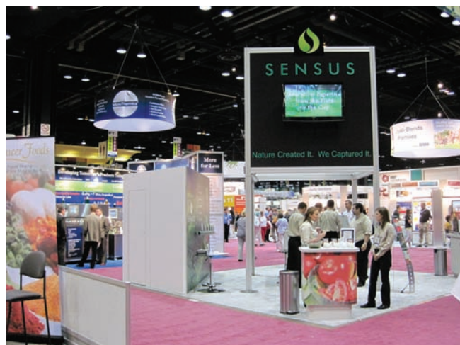
The Sensus team.