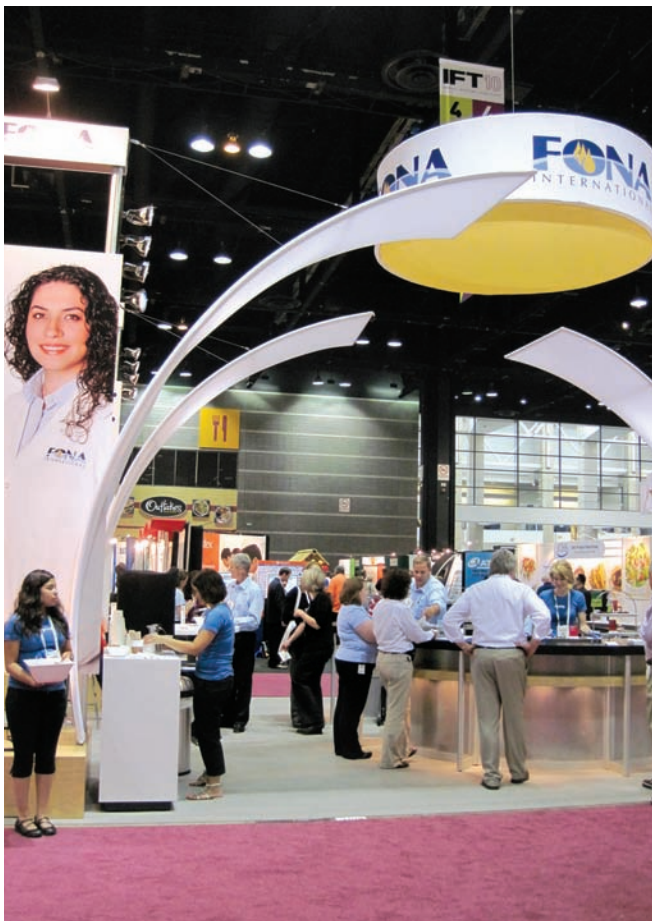
A view of the FONA booth.