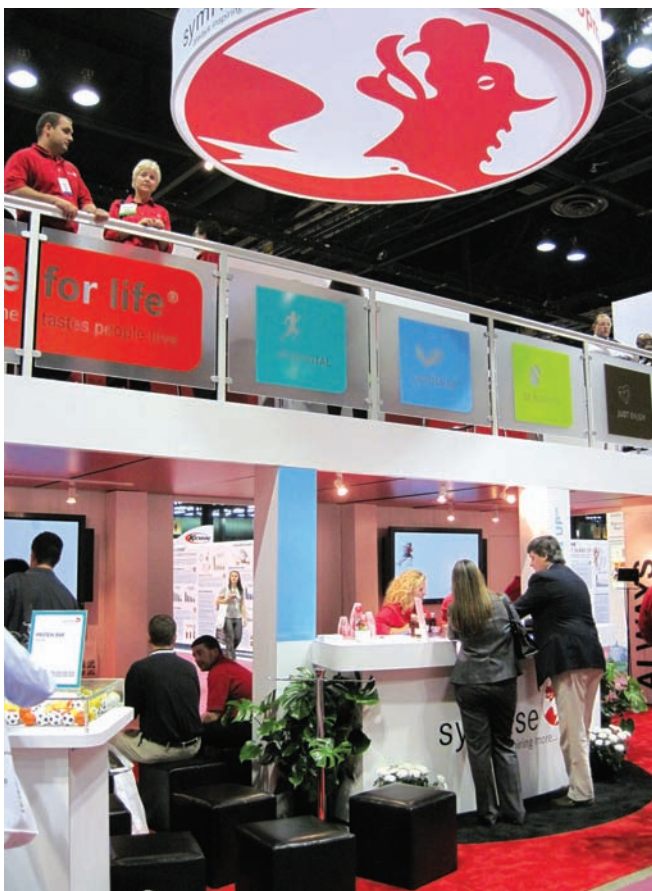
The Symrise booth.