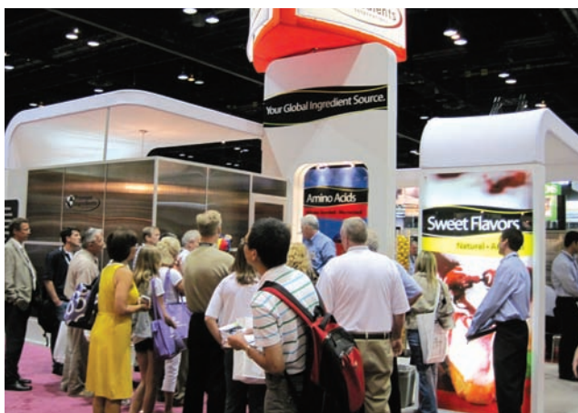
A view of the Premium Ingredients Booth.