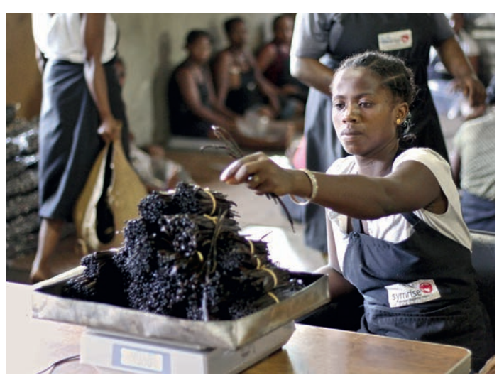
Several hundred people are employed by Symrise during the peak season, with as many as 200 employees working on vanilla bean fermentation via traditional methods at the company's new fermentation and storage complex in Antalaha.

that will pay more for sustainable goods, but that population is pretty small. About 75% of the population will actually buy sustainable goods over non-sustainable goods at the same price. Our group looks at sustainability as an ability to go forward in a marketplace, the ability to provide value to stockholders, to provide goods and services that are high-value and economical."