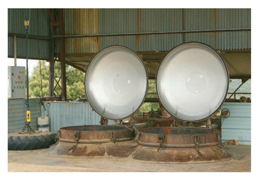
The process of distillation using water and steam is essentially an environmentally friendly one, so long as energy-efficient boilers and condenser systems are used.

Today's essential oil industry is a pale shadow of this former glorious past. In many countries, the industry is not much more than a tourist attraction. When one visits the great former centers of global essential oil production like Provence, France, Plovdiv, Bulgaria, Florence, Italy, or even Cairo, Egypt, one will see an industry living off its past glory, selling samples and trinkets, rather than the vibrant value-added agro-industrial sector that it should be.