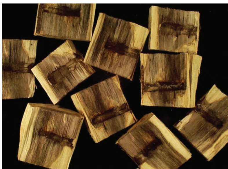
TRP resin inoculation experiments aided the production of resin.

Even better are florasols, which use a refrigerant-based material (1,1,1,2-tetrafluoroethane) as the extraction solvent. This process is so gentle that some seeds are still alive after extraction and can be germinated. It is non-toxic and non-hazardous, requires very little energy, uses no water and produces no effluent. Sadly, although this technology has existed for more than 25 years, it has not been widely accepted by the fragrance industry to date.