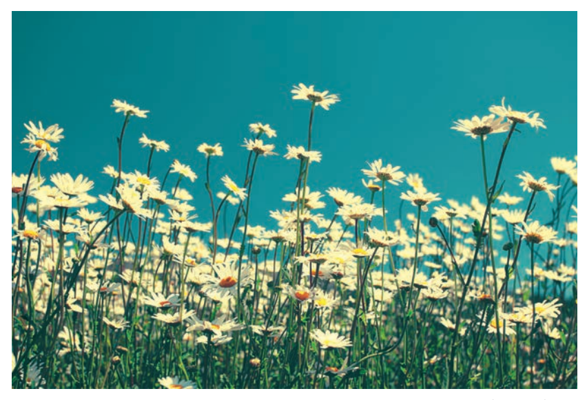
Only where mechanization can be cost-effectively employed, as with chamomile (pictured) and lavender, can we expect to see sustainable natural florals still on the market.

And how would the public react if they read Charles Sell's excellent book "The Chemistry of Fragrances," which clearly shows that the production of many natural essential oils