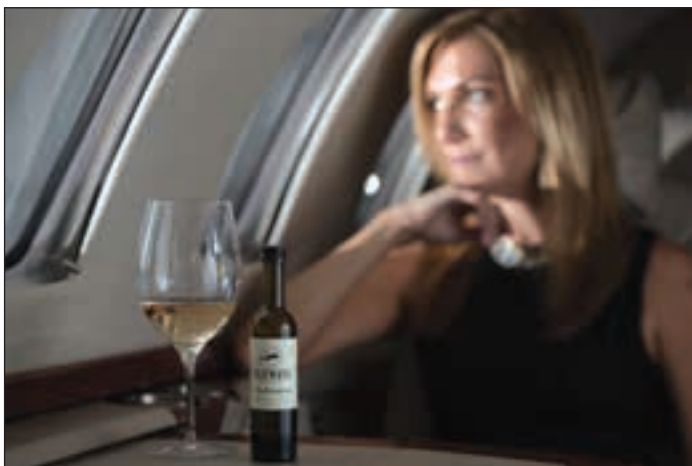
FlyWine features super premium wines available in single serving 100 ml "Traveler" bottles.

Driven by creativity and technology, interactive "drinkable billboards" appear to be the latest trend in advertising and sampling campaigns. In Indianapolis, Coke Zero and Ogilvy & Mather installed a "drinkable billboard" as part of its NCAA Men's Final Four competition sponsorship in April. The interactive billboard dispensed soda through a 4,500 foot straw that spelled out "Taste It" and led to a sampling station with six fountain spouts. Similarly, Carlsberg partnered with Fold7 and Mission Media to create a beer-dispensing billboard. The billboard was located at The Old Truman Brewery on Brick Lane in London and featured "Probably the best poster in the world" as a headline. Inside the Sao Paulo metro station, Cafe Pele and Brazilian LewLaraTBWA designed an interactive billboard with a built-in motion sensor that played a contagious video of a young man yawning. The more commuters around the billboard, the more the man would yawn, causing everyone to yawn. Eventually the ad said "Did you yawn too? It's time for coffee," and Cafe Pele representatives with free espresso shots appeared. Although not an advertisement for a brand, Lima,