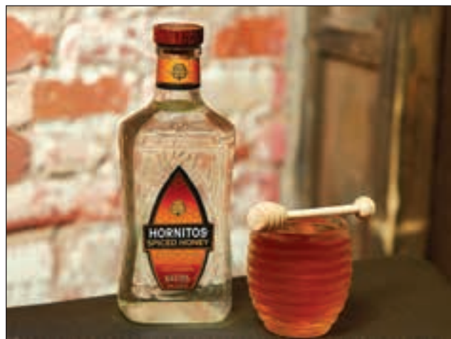
Looking for the next spicy success, manufacturers are formulating new flavors in tequila. Hornitos Spiced Honey Tequila is a new addition.

Newer flavor introductions include Jack Daniel’s Tennessee Honey , Jim Beam Apple , and Raven’s Lace Peach Berry Whiskey . Marketed to female consumers, Raven’s Lace Peach Berry Whiskey is 60 proof and combines juicy peach and sweet strawberry with Bourbon whiskey. In July, Beam Suntory Inc. launched an anticipated bourbon and Scotch hybrid, Jim Beam Kentucky Dram . It is described as premium bourbon infused with Highland Scotch whisky that has a “smoky flavor with vanilla and oaky notes.”