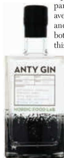
Nordic Food Lab and The Cambridge Distillery engineered Anty Gin and each bottle contains the essence of approximately 62 wood ants.

Santa Fe Spirits, New Mexico's largest distillery, launched Atapiño liqueur using local ingredients—piñon (pine) nuts and ponderosa resin. To extract the essence of piñon, Santa Fe Spirits roasts the piñon nuts and soaks them in a barrel of Silver Coyote single malt white whiskey for two months. With its recent re-launch in the U.S. and consumers' renewed interest in bitters and bitter flavor profiles, Amaro Lucano is gaining popularity. Originally used as an after dinner digestif, this Italian bitter is making its way into cocktails to create depth and dimension. The recipe includes a blend of 30-plus high-quality herbs and essential oils. In April, La Quintinye Vermouth Royal inspired by King Louis XIV's botanist, launched its three vermouths in the U.S. Rouge , Blanc and Extra-Dry all share the same 12 base botanicals including artemisia (wormwood), vine flowers, angelica, iris roots, cardamom, cinnamon, cinchona (quinine bark), Citrus aurantium (bitter orange), ginger, licorice, nutmeg and Quassia amara (bitter wood). Nordic Food Lab and The Cambridge Distillery engineered Anty Gin . Using 100% organic grown English wheat, each bottle contains the essence of approximately 62 wood ants that are accom-