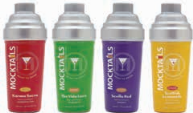
Packaged in a unique re-usable glass shaker, Mocktails is a line of natural, RTD non-alcoholic cocktails in four varieties: Karma Sucra Cosmopolitan, Vida Loca Margarita, Sevilla Red Sangria and Scottish Lemonade Whiskey Sour.

A host of new brands of non-alcoholic premade mixers and premade alcoholic cocktails are available with a multitude of flavors. Jell-O shot-like formulas, both alcoholic and non-alcoholic, are the popular application. This no “mixologist required” trend is garnering attention as evidenced in a February 2015 New York Times f article and April 2015 Newsweek g article.