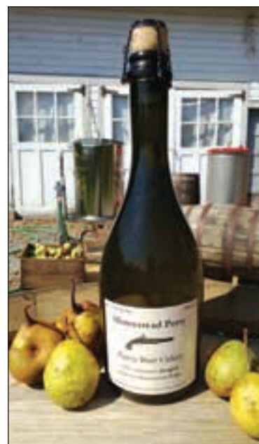
Aaron Burr Homestead Perry is made with 100% foraged pears from the Shawangunk Ridge.

Slovins concludes, “In the alcoholic beverage area, we are seeing an increase in hard ciders, and medium-low proof beer/malt based cocktails like Mixxtails aimed at the non-beer drinkers, or simply at somebody looking for a change in taste.”