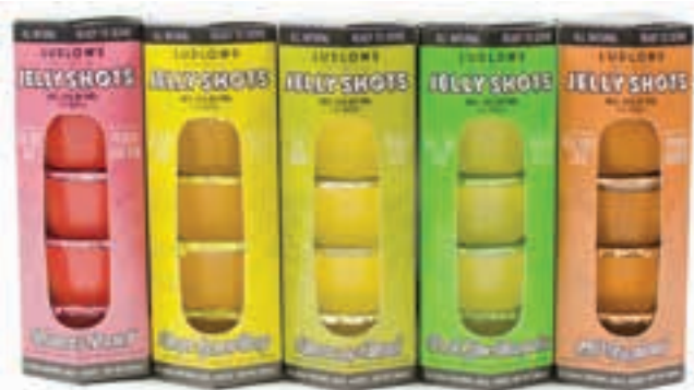
Inspired by popular craft cocktails, Ludlow's Jelly Shots are 30 proof, all-natural, premium, pre-packaged and ready-to-serve.