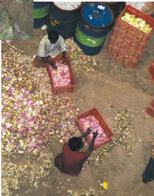
Preparing lotus flowers for the extraction process.

producer and broker and made a trade. The biomass proceeded by truck to arrive 12 h later, and 24 h before my arrival at Jasmine Concrete Exports' Coimbatore factory. Lotus flowers can tolerate up to two days post harvest before processing is necessary. Since May 2003, Jasmine Concrete Exports has operated its factory in Mudrai, 300 kilometers from Kanyakumari, allowing same-day lotus flower collection, delivery and processing.