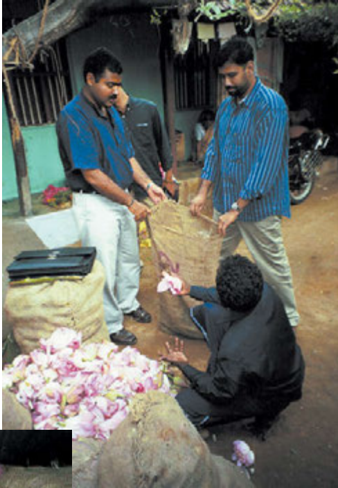
This lotus broker shows the product and makes a deal.