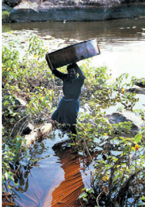
Lotus ponds, used for rice paddy irrigation and water management, range in size from marginal puddles to lakes.