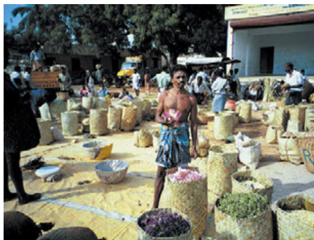
The Thovalam wholesale flower market: from here, lotus flowers enter the retail market.

city of Kanyakumari for the surrounding rural areas to see the lotus flower harvest and then the wholesale flower market in Thovalam. Lotus flower and leaf (the latter used as “ecologically sensible” disposable dinner plates) collections take place from 5:00 AM to 7:00 AM, at which point the biomass ships to the wholesale flower markets.