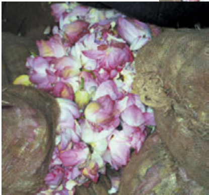
Purchased lotus flowers are open for inspection.