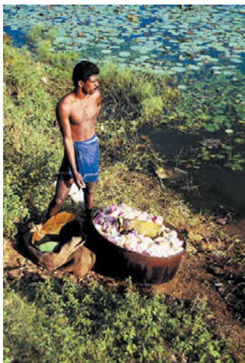
The experienced lotus collector, plucking flowers and leaves manually, completes harvests in under 3 h, an effort that yields ~150 kg of flowers and leaves.

Kerala, and then drove 2 h to Kanyakumari, crossing back into Tamil Nadu. “The Land of Temples” perfectly captures the spirit of Tamil Nadu. Kanyakumari is located at the heart of pink and white lotus land. This plant is India’s most holy flower, sacred to the Goddesses Lakshmi and Surawesti. In this land closed lotus buds dipped in scented water anoint and bless devotees. In respect and hopes of bountiful blessings, many will name their daughters Lakshmi.