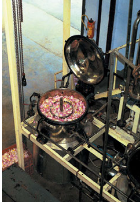
Lotus flowers in the extractor.