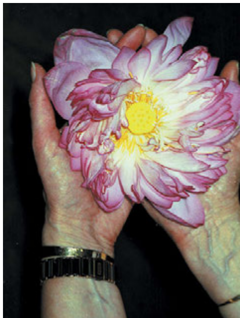
An open lotus flower.