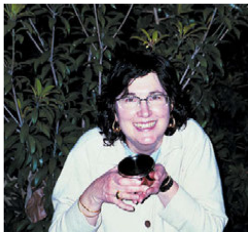
The author holding pink lotus concrete: the material is glossy dark reddish-brown, viscous and slightly resinous.

need to be open and not bruised to manufacture the premier quality concrete and absolute. I congratulated the producer on his harvesting expertise and his intimate and vast knowledge of "lotus flower and pond economics."